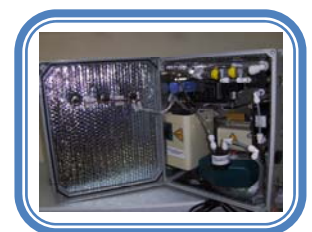
EMCU Internal View